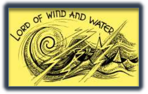
Mark 4:35-41 Who can this be? Even the wind and the sea obey him.